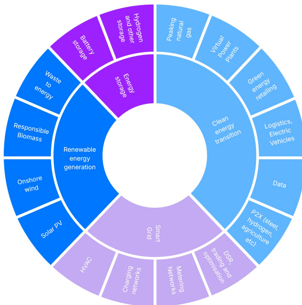
Figure 1: Quinbrook’s Investment Universe

Quinbrook invests directly into low carbon energy supply infrastructure assets and related businesses that support the energy transition.